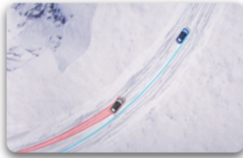
▲ Intelligent anti-slip system