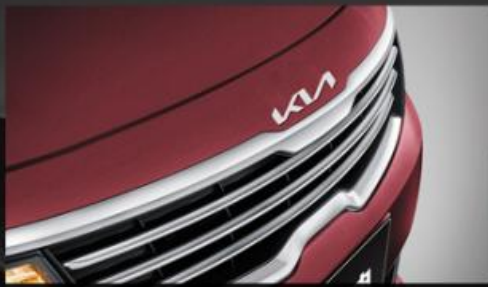
▲ Cross plated front grille