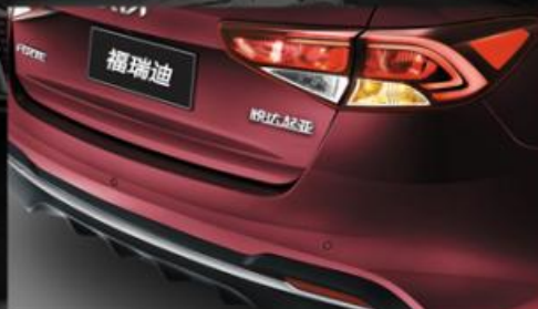
▲ Chrome trim on rear bumper