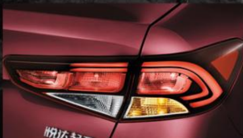
▲ LED combination taillights