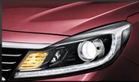
▲ LED daytime running lights