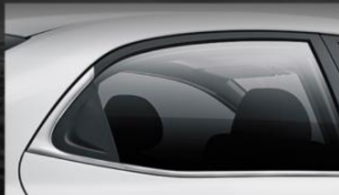
▲ Chrome plated door waist line