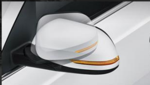
▲ Electric foldable rearview mirror