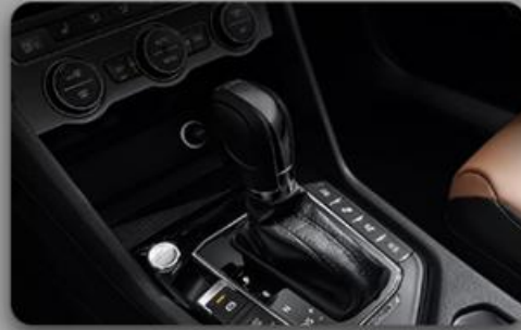
DQ381 seven-speed dual-clutch transmission