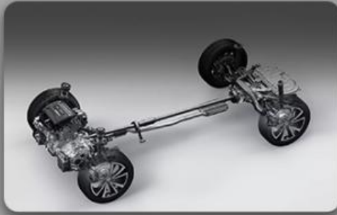
4MOTION all-wheel-drive system