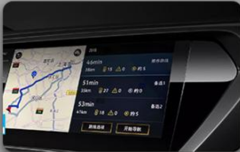
9.2 inch intelligent multimedia interactive system