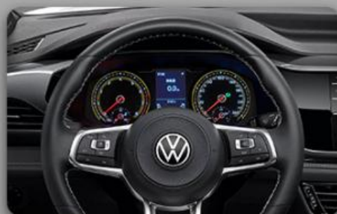
Exclusive multifunctional steering wheel