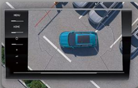
360° Panoramic reversing image