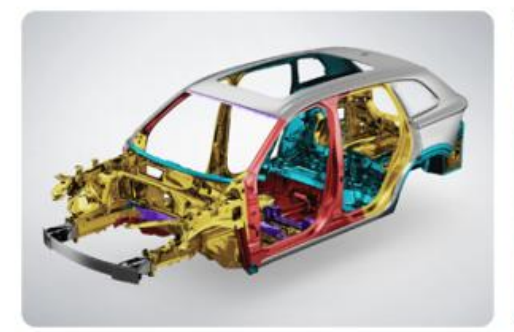
Super safe body structure