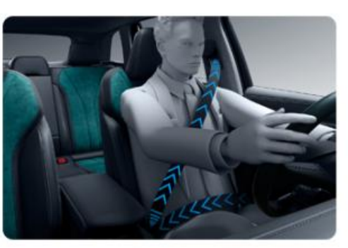
Active preload seat belt