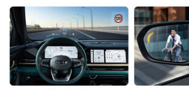
TSR traffic sign identification