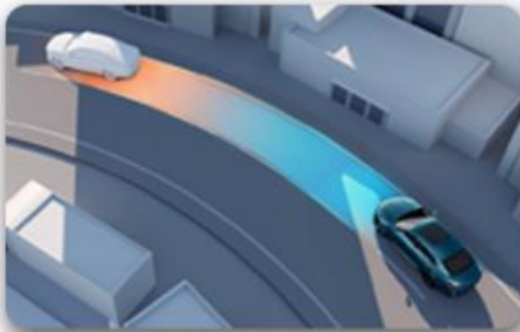
ICC intelligent navigation system