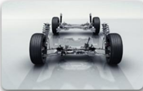
Four wheel independent suspension