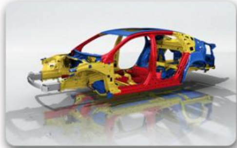
High strength cage body structure