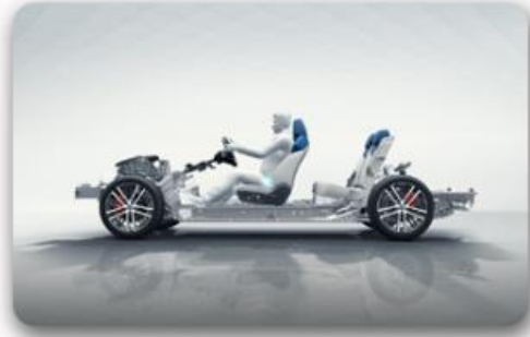
CMA architecture strong performance driving control