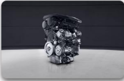
2.0TD medium direct injection turbocharged engine