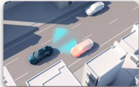
BSD blind area monitoring system