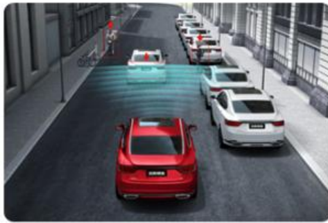
AEB urban pre-collision