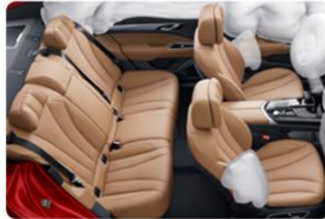
Omni-directional 6 airbag Flexible protection