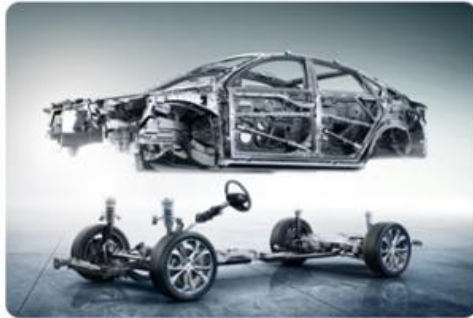
Five Star safety + lightweight body