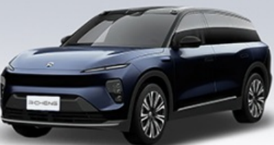
● DARK BLUE

RUICHENG Chengdu Ruicheng Automobile Service Co., Ltd.