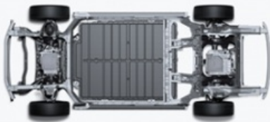
▲ Intelligent four-wheel drive