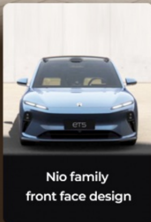
Nio family front face design