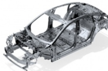
▲ Steel and aluminum hybrid body