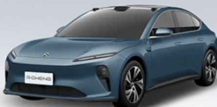
● DARK BLUE