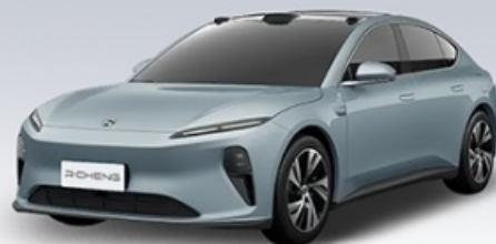
● LIGHT BLUE