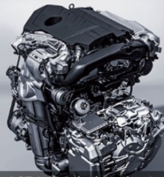
1.6 T single turbocharged engine Aixin 6AT third generation hand automatic transmission