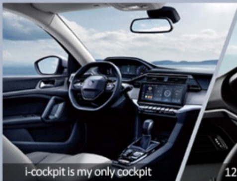
i-cockpit is my only cockpit