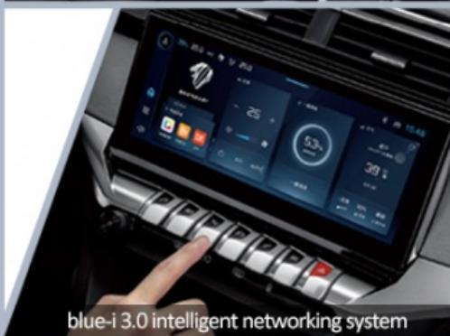
blue-i 3.0 intelligent networking system