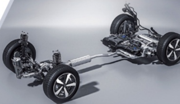
A hundred years of master CLDR tuning chassis