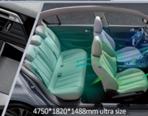
4750*1820*1488mm ultra size