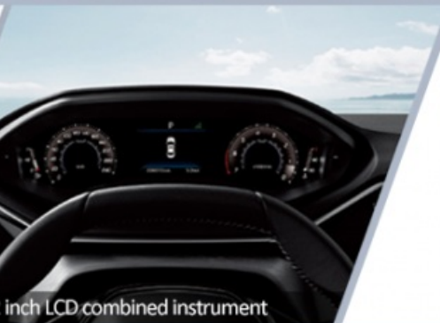
12 inch LCD combined instrument