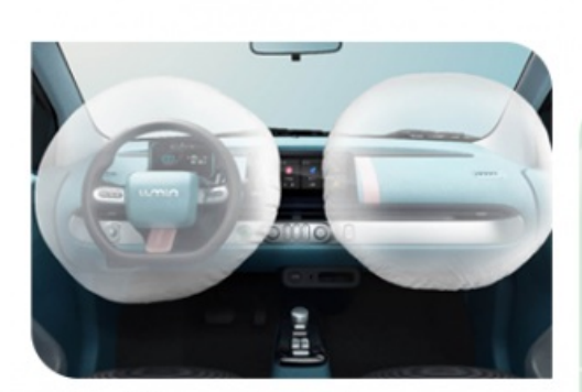
Two airbags at the front row