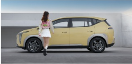
▲ Doors will be automatically unlocked while the driver is getting closer