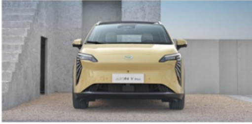
▲ Smart 540° panoramic image