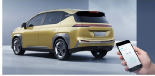
▲ Intelligent remote parking