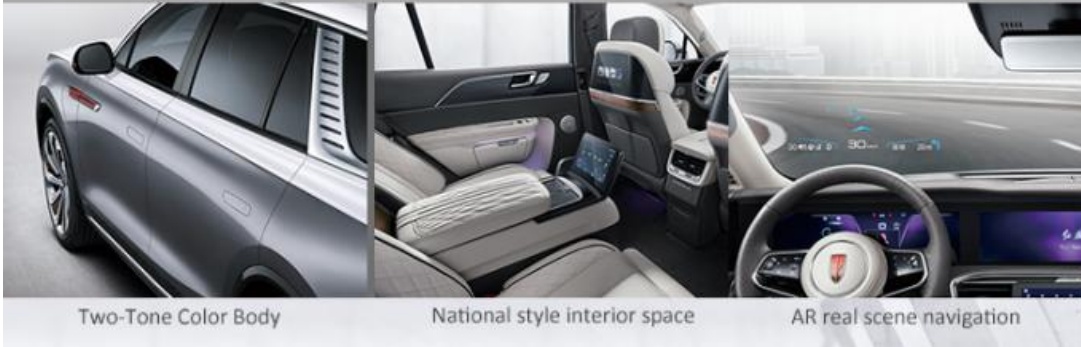
Two-Tone Color Body