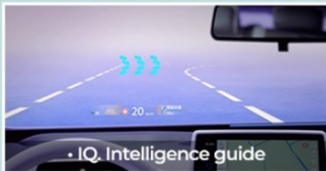
• IQ. Intelligence guide