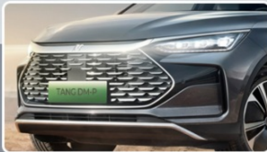
Dragon Face before movement