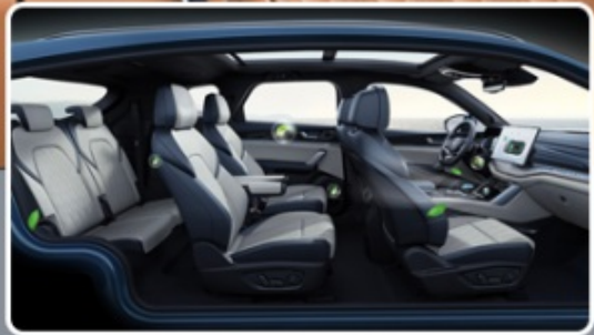
▲ Intelligent health ecological cabin