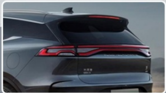
Seamless penetration LED taillight