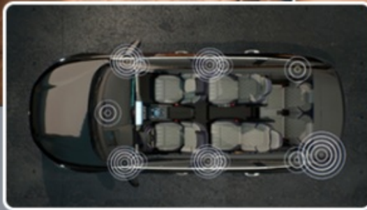
▲ HiFi grade custom Danah stereo