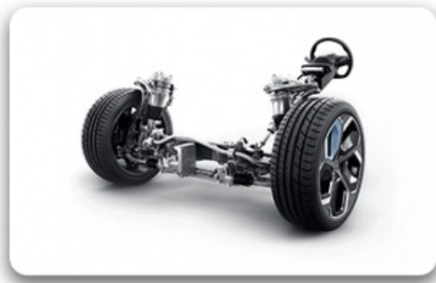
▲ High-performance chassis system