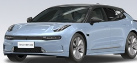
● LIGHT BLUE