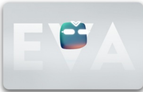
▲ AI Mate Intelligent assistant