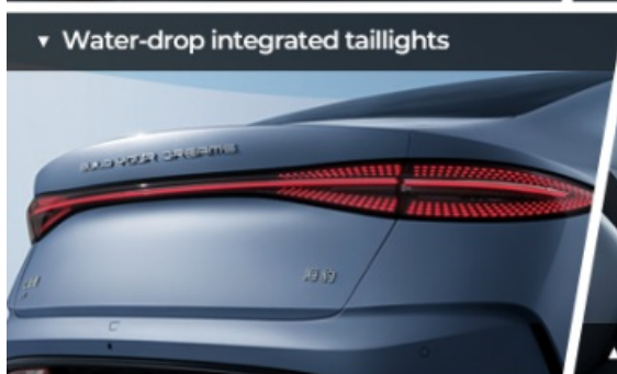
▼ Water-drop integrated taillights