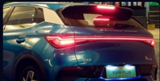
Through-through LED tail light