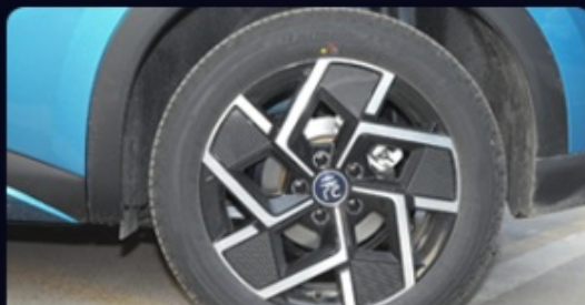
18 inch aluminum alloy wheel