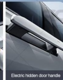
Electric hidden door handle