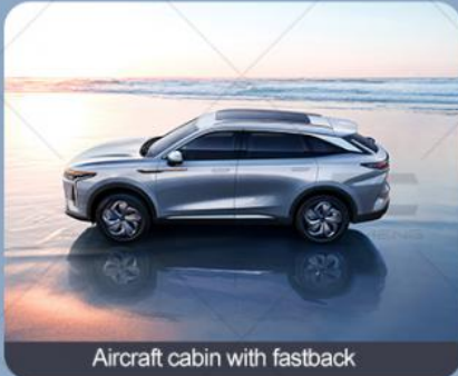
Aircraft cabin with fastback