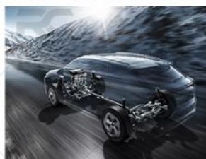
All-terrain intelligent four-wheel drive system