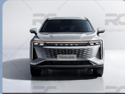
Wide body and hellaflush