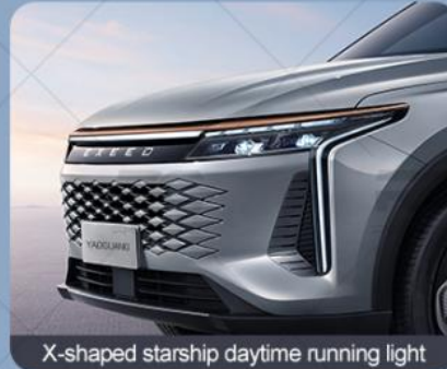
X-shaped starship daytime running light