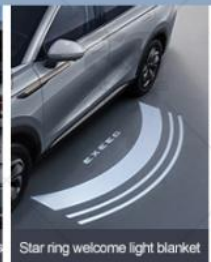
Star ring welcome light blanket