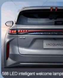
588 LED intelligent welcome lamps