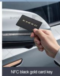
NFC black gold card key