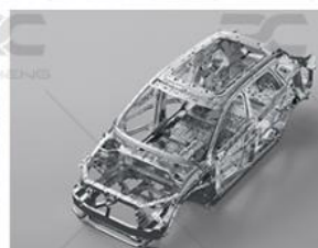
Global five-star safety standard design

2.0T GDI & 7 DCT more powerful CDC electromagnetic suspension system All-terrain intelligent four-wheel drive system Global five-star safety standard design