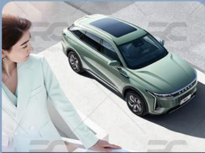
Atlantis light aesthetic design