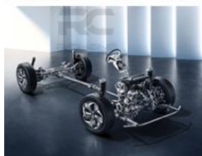
CDC electromagnetic suspension system