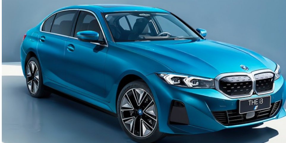
BMW i3 New pure electric from BMW