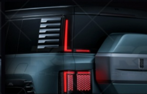
Multiple LED light belts in D column