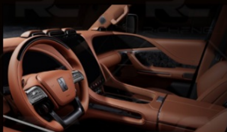
Intelligent follower seat