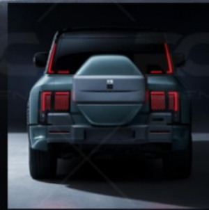
Square simple rear shape