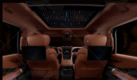
Luxurious and comfortable cabin