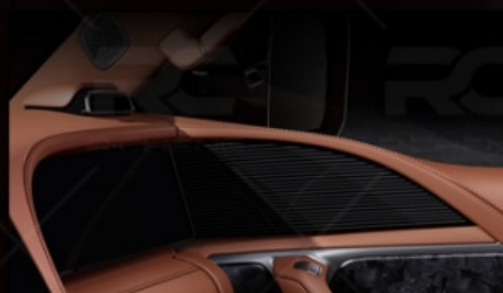
High-End sound system