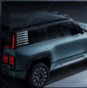
Balanced car-window proportions