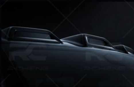
Roof detection system