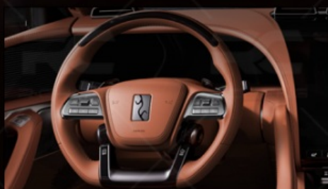
Four-panel steering wheel