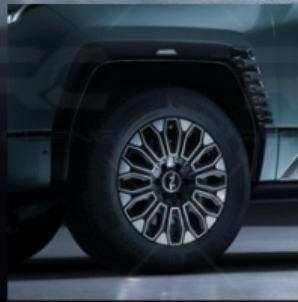
Both strength and function