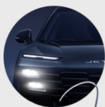
Streamer's wings LED headlights