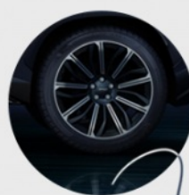
20 inch wheel 255/45 R20