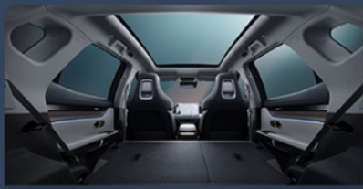
Ultra wide Angle panoramic canopy