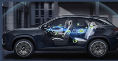
Cabin ecological purification system