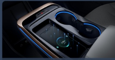
50W wireless fast charge