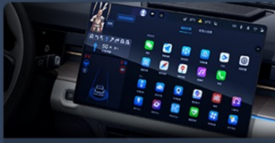
15.6 inch suspension smart screen