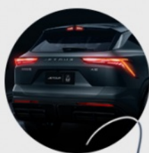
Halberd LED taillight