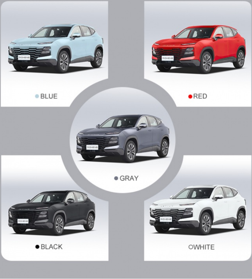
2023 Chinese Jetour Dashing 5 Door 5 Seats SUV 1.6T DCT Jetour Gasoline Car