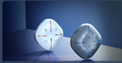
Rubik's Cube Key