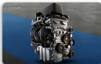
1800VVT naturally aspirated engine