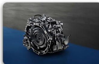
CVT Smart five stage transmission