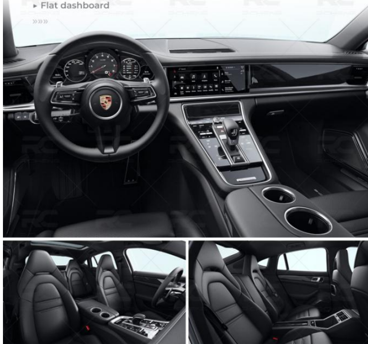
Sports car grade ergonomics Head-up display system Up-tilting center console Analog tachometer in the center of the instrument cluster Flat dashboard