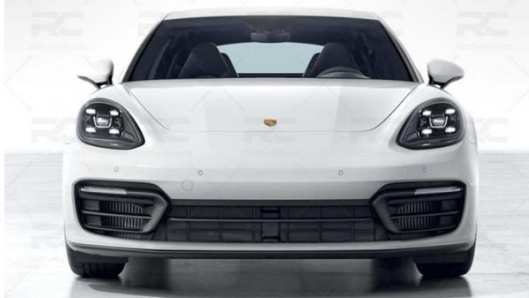
Newly designed chassis system